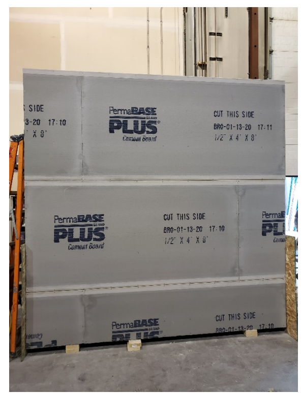
Figure 4: The exposed face prior to the stucco application.