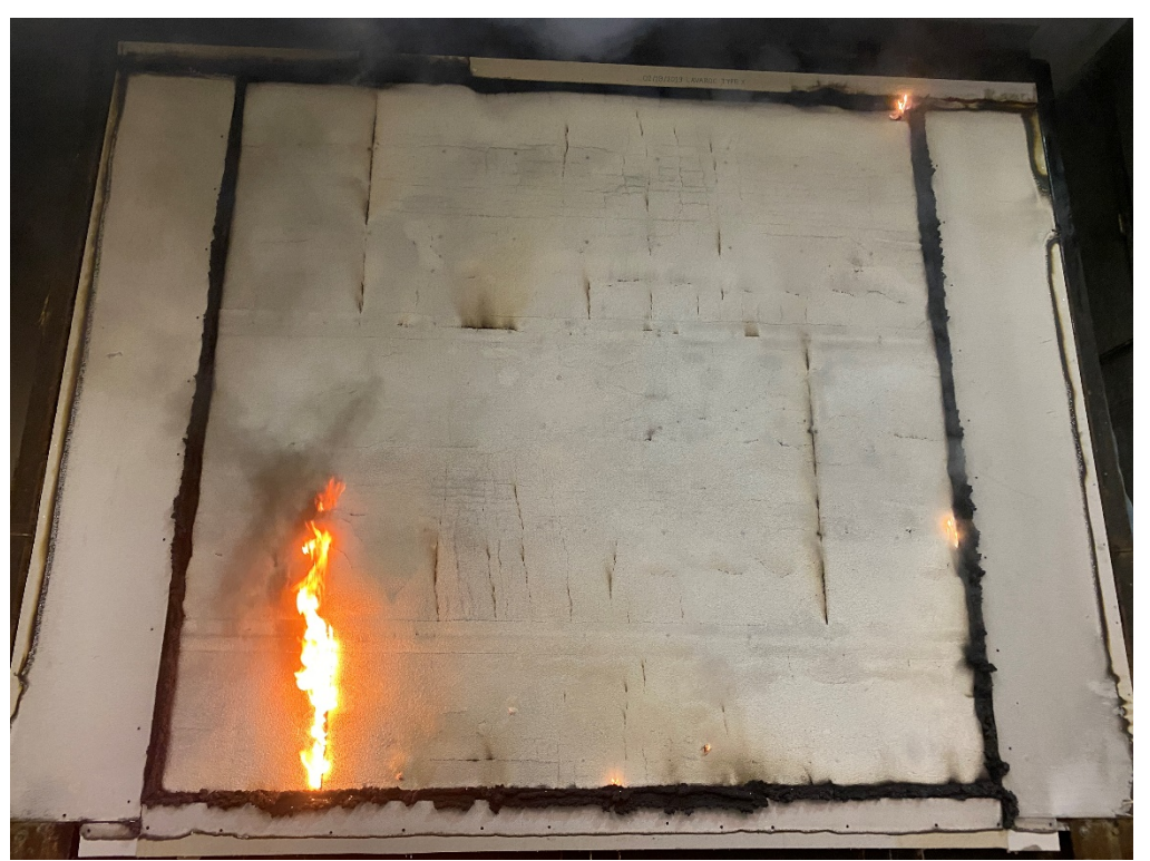
Figure 6: The exposed face after the fire test.