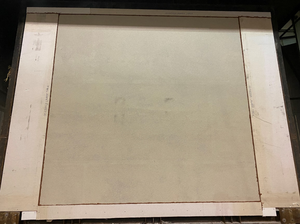
Figure 5: The exposed face prior to the fire test.

Client: Genyk Job No.: T1296-6 Report Date: December 7, 2020 Page 11 of 11