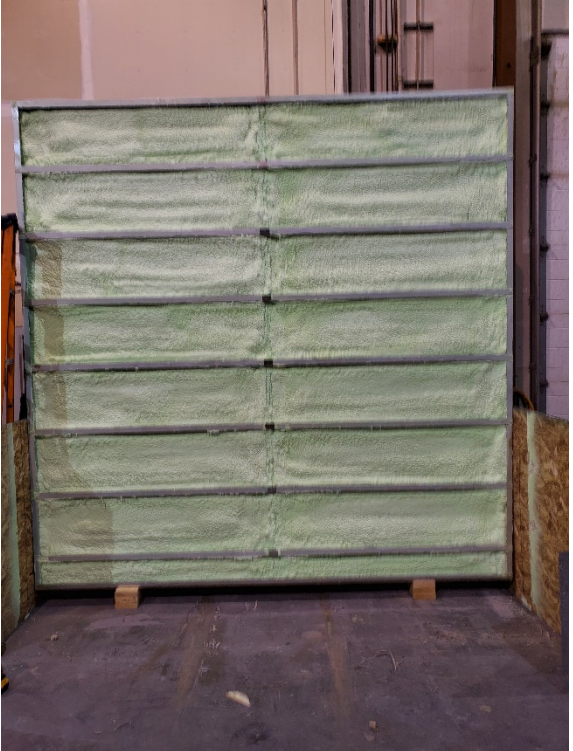
Figure 3: The exposed face prior to the cement board.

Client: Genyk Job No.: T1296-6 Report Date: December 7, 2020 Page 10 of 11