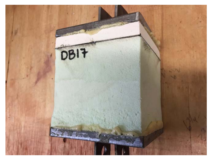
Figure 1 : Prepared Foam sample installed on Blueskin SA for testing

Testing was completed in substantial compliance with ASTM D1623-03 (Standard Test Method for Tensile and Tensile Adhesion Properties of Rigid Cellular Plastics) for a Type C specimen. Samples 4" by 4" (16 sq. inches) in surface area and 4" in total thickness (including DensGlass sheathing) were chosen. A photograph of a sample is shown in Figure 1. The objective of the test was to demonstrate that the adhesion of the spray foam to the substrate (DensGlass or Blueskin SA in this case) exceeded the Air Barrier Association of America (ABAA) adhesion requirement for an air barrier material on a substrate of 16 psi (110kPa). For the 4"x4" sample size chosen, a load of 256 lbs was the minimum target.